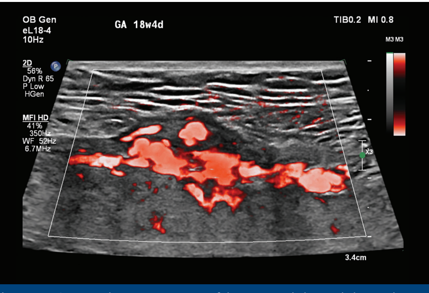
Figure 7 eL18-4 transducer MFI HD image of the suspected placental abnormality.