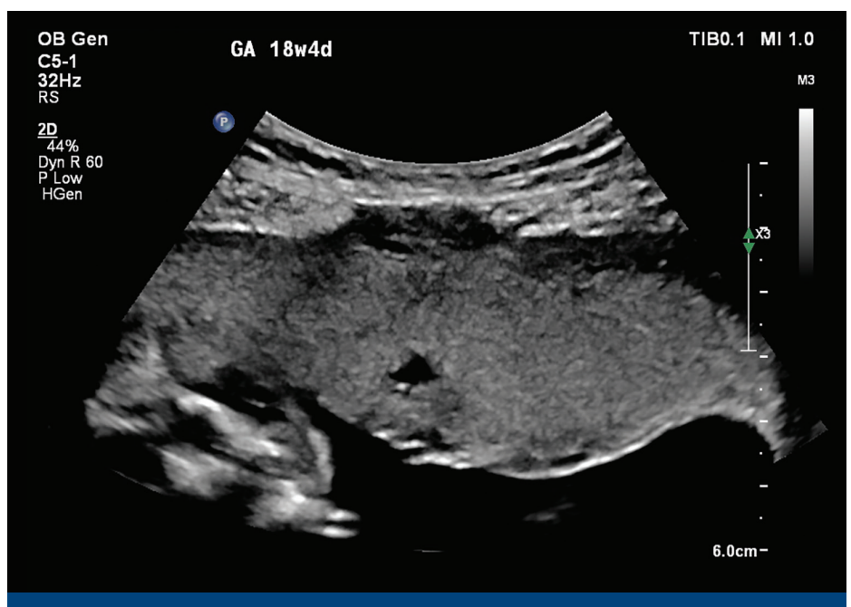
Figure 1 C5-1 transducer sagittal image of suspected placental abnormality.

Significant advancements in prenatal diagnostic ultrasound now permit the determination of gestational age, number of fetuses, type of multiple gestation, pregnancy viability, placental abnormalities, and the diagnosis of minor and major fetal anomalies. 2D ultrasound is the preeminent modality utilized in the evaluation and prenatal diagnosis of placental abnormalities. The use of color flow Doppler also is utilized to improve the detection of PAS. Differentiating between normal and abnormal, as well as the extent of the abnormality, is imperative for the clinician involved with counseling the patient as different diagnoses may predict a more significant surgical procedure and a higher complication rate.1