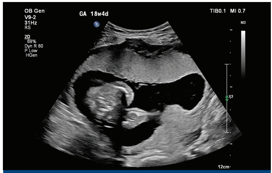
Figure 2 V9-2 transducer sagittal image of suspected placental abnormality.

The patient was enrolled in a clinical evaluation study of the eL18-4 linear and V9-2 PureWave volume transducers which was ongoing at the time of her consultation at our practice. Utilizing the eL18-4 linear and V9-2 PureWave volume transducers on the Philips EPIQ Elite ultrasound system, additional imaging was performed with particular focus on the suspected placental abnormality and the placental-uterine interface. MicroFlow Imaging (MFI) and MicroFlow Imaging High Definition (MFI HD), designed to enhance the visualization and image resolution of low velocity blood flow, were utilized to assess the placental and uterine anatomy.