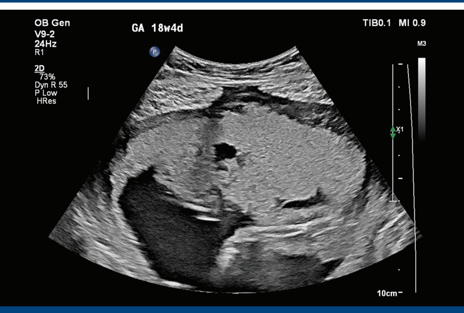
Figure 3 V9-2 transducer sagittal image of suspected placental abnormality.

Figure 2 V9-2 transducer sagittal image of suspected placental abnormality.