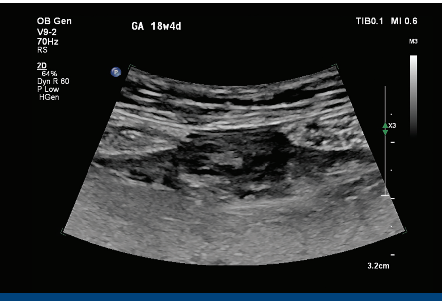
Figure 4 V9-2 transducer sagittal close-up of suspected placental abnormality.