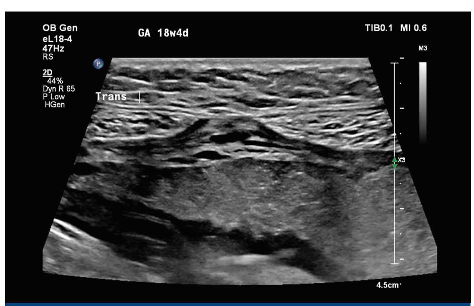
Figure 5 eL18-4 transducer close-up of the suspected placental abnormality.